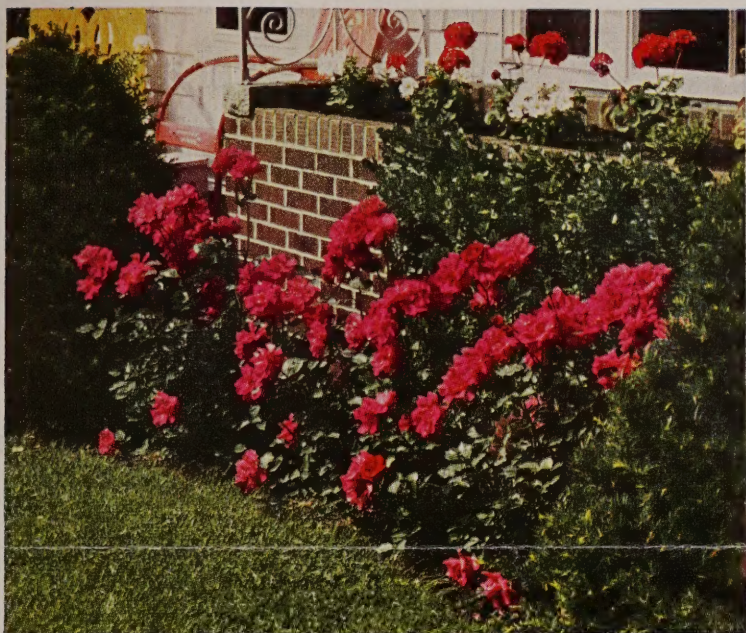
QUEEN OF THE LAKES — Sub-zero Rose used in landscape planting. Adds beauty and color. Potted plants each $1.75